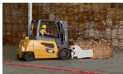
Battery-powered clamp truck at Kingsport mill moving OCC bales.

An equivalent of 59% of the electricity used in our pulp and paper mills was self-generated. Industry average = 58 percent.**